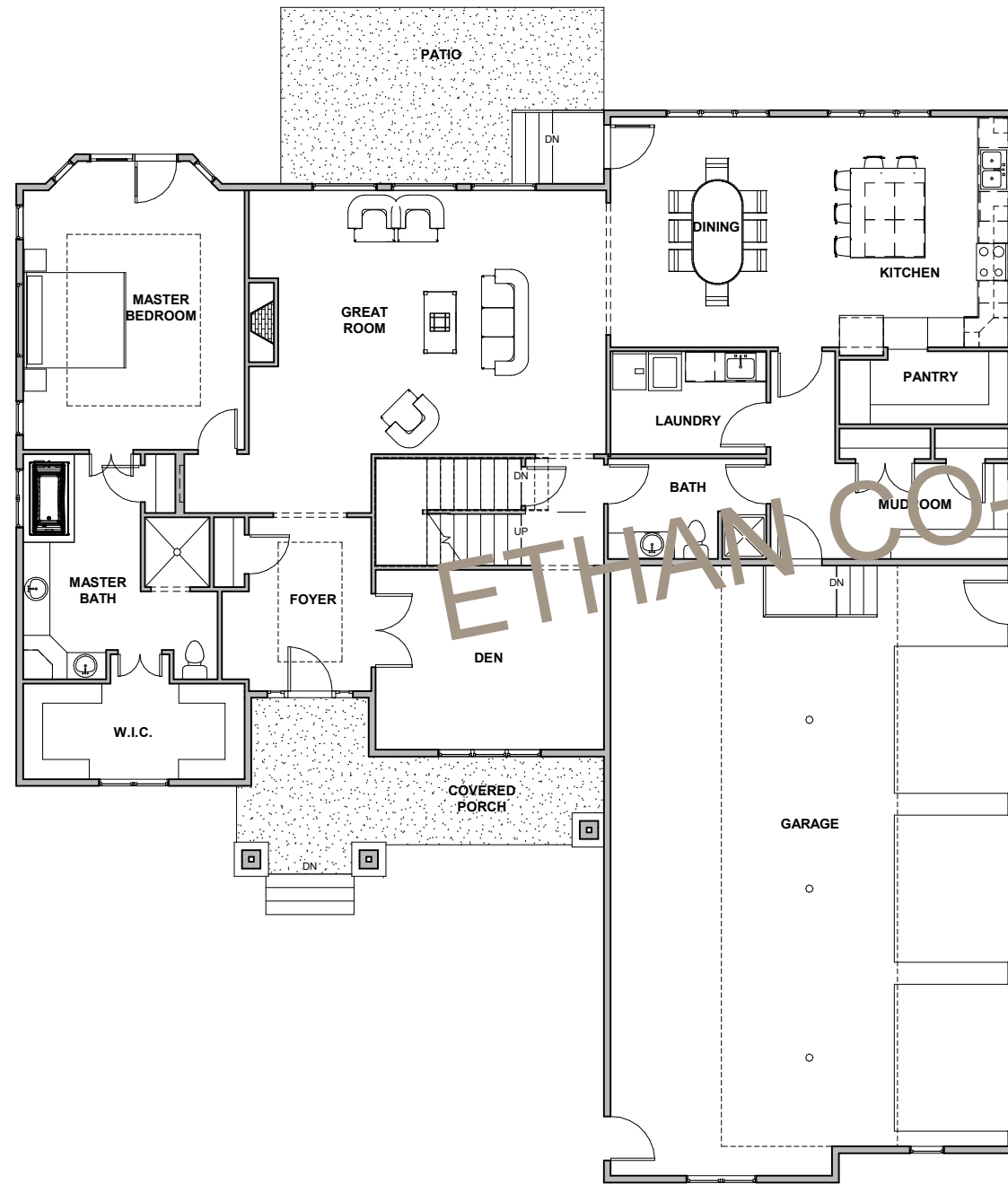
① First Floor 3/16" = 1'-0"